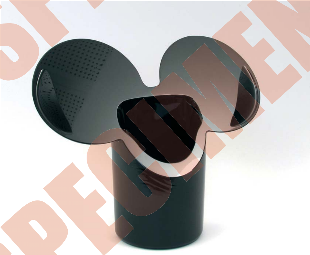
Picture as seen from the front

The name of the piece if known: Smile Year of manufacturing: 1994 Place of manufacturing: Iittala, Finland Signature of the piece: Smile Timo Sarpaneva Iittala 1994 Height of the piece: 21 cm Width of the piece: 26 cm